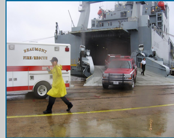
Cape Vincent/Victory Hurricane Rita—Beaumont, TX

“ Providing a safe haven for essential personnel, equipment and aid needed to get the affected areas “back up and running” as soon as possible.”