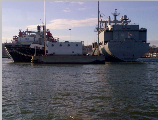
TS Wright and Kennedy Hurricane Sandy 2012