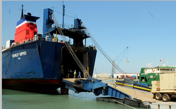
Above: Crowley ship after Haiti Earthquake 2008